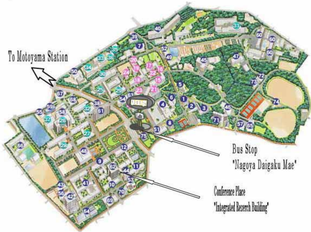
Conference Place : Integrated Research Building (No.62)

Directions: [Subway] Take the Higashiyama Subway Line to the Motoyama Station. (Use exit 3 or 4.) [Bus] Catch a bus at Motoyama for Shimada Jutaku, Hirabari Jutaku, or Nagoya Daigaku. Get off at Nagoya Daigaku Mae. (¥200/each way) [Walk] It is about a 15minute walk from Motoyama Station. (the distance from Motoyama Station to Nagoya University, Although it is only 1.2km the walk is uphill.)